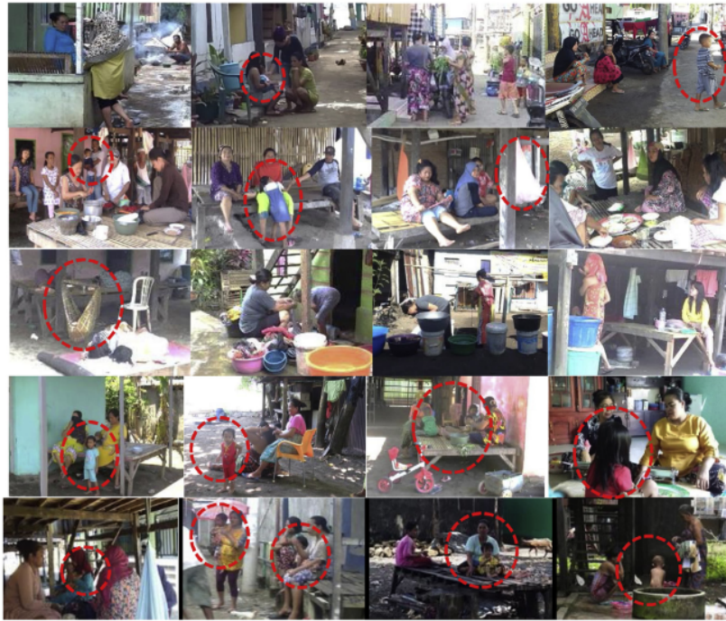
Figure 2 A forms series of women's domestic and social activities.